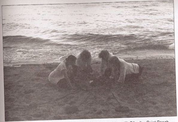
Image 4: Gestare Art Collective, placenta ritual, from video still. Gibraltar Point Beach, Toronto Island, Ontario, Canada, 2010.

blood back to the Earth is a practice of reciprocity inspired by wisdom and indigenous traditions of women's lodges. Individual birth soundings uttered through the experience of re-birth, or self-birth coalesced momentarily with the releasing of the menstrual blood. Through the performance ritual we psychically encountered a re-co-birth and a co-transfusion of matrixial blood within the matrixial sphere.