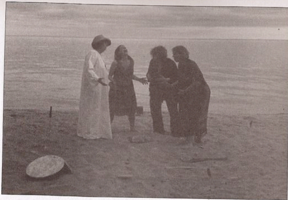
Image 3: Gestare Art Collective, M/Other Ways , performance ritual video still. Gibraltar Point Beach, Toronto, Ontario, Canada, 2010.