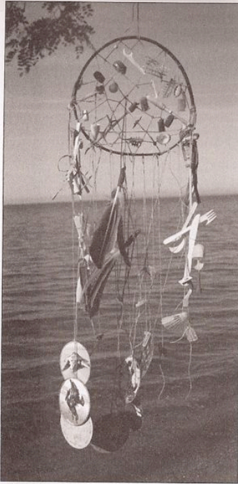
Image 7: Medwyn McConachy, Oil Catcher , found objects, string, photographs, paper, thread. Gibraltar Point Centre for the Arts, Toronto Island, Ontario, 2010.