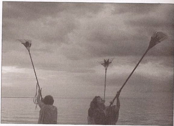
Image 2: Gestare Art Collective, Tracing Absence Sounding Presence , performance ritual video still. Gibraltar Point Beach, Toronto, Ontario, Canada, 2009.

between. The mystery of embodied knowing unfolded during the residency, supported expansion beyond our individual selves to develop the larger mind/Self of being. In this state we understood ourselves to be part of the larger whole of the Kosmos.