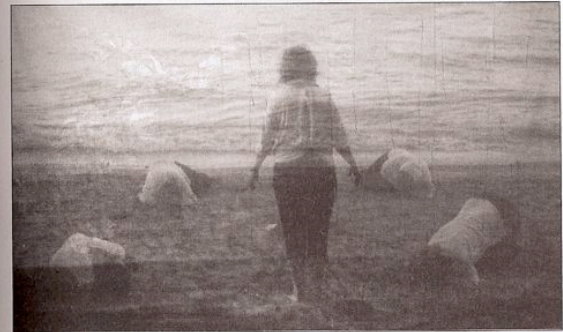
Image 6: Barbara Bickel, Wit(h)nessing Eyes Close(d) , video still. Projection onto canvas, paper collage, thread and paint.